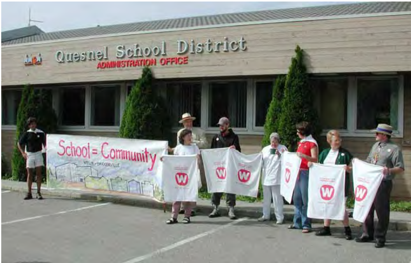
Launch of hunger strike, July 2002. Quesnel Mayor Steve Wallace at right.