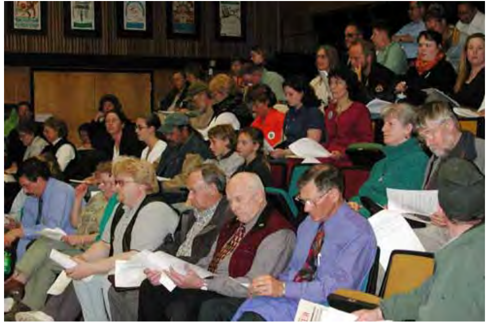
Some of the many Wells and Cariboo residents who packed the May 29 public meeting at Correlieu School.